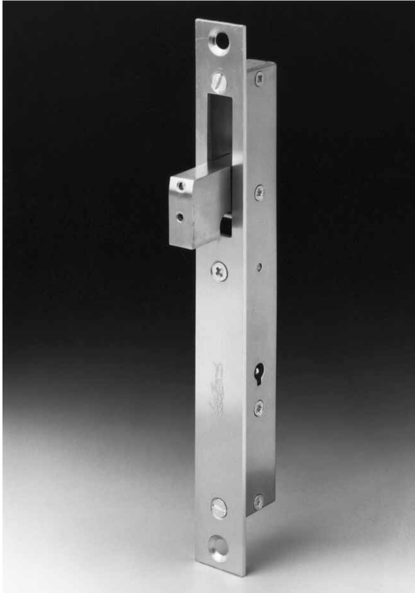
VNS 27A VNS 27AA VNS 27FA VNS 27FAA