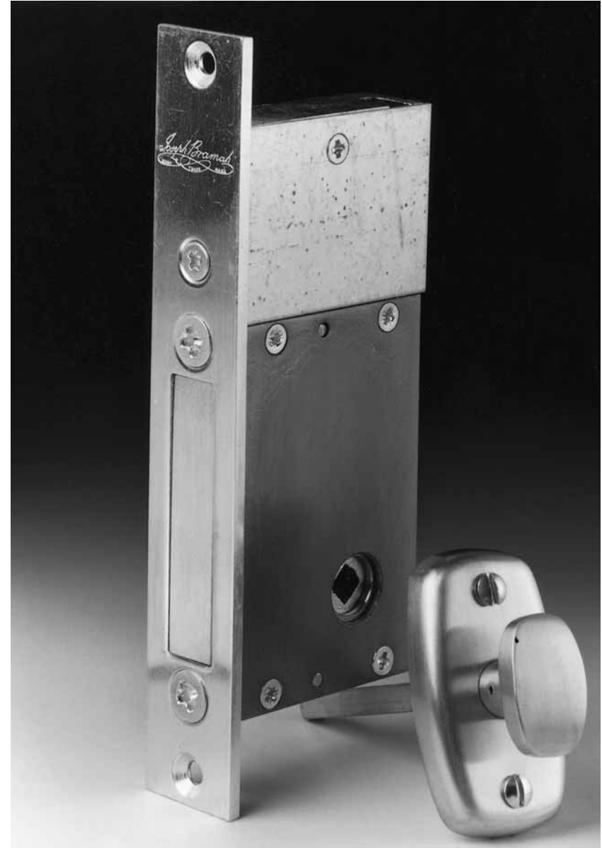
MD 17KA MD 17KAA