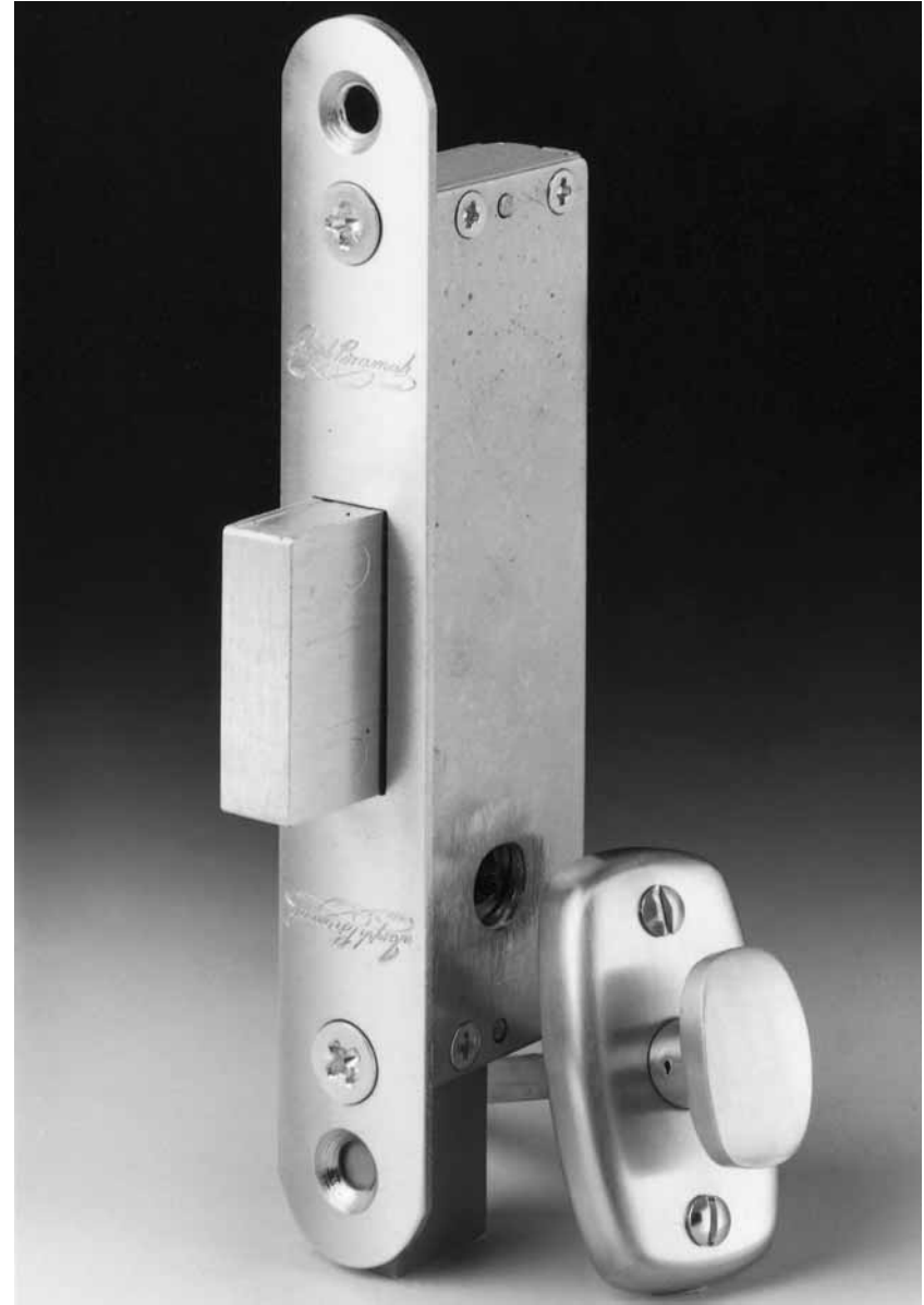
NS 17KA NS 17KAA