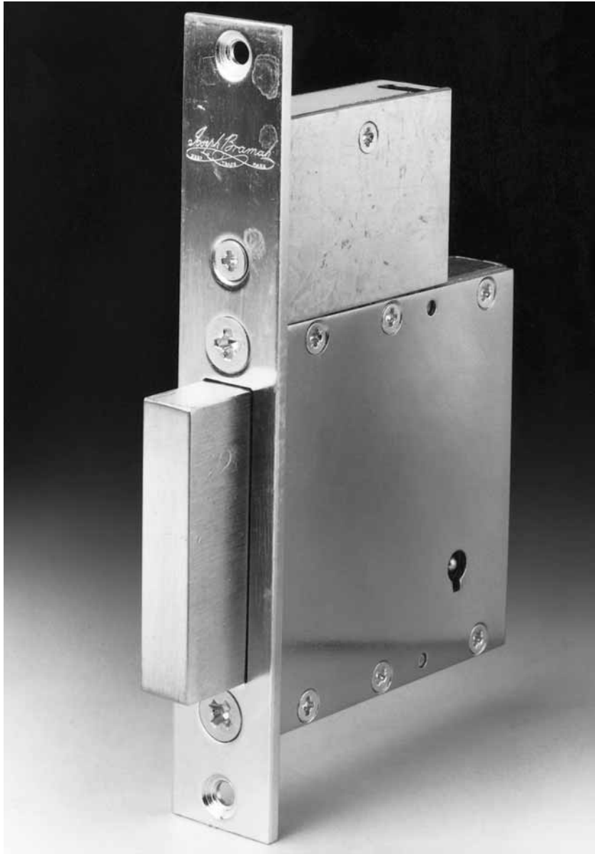
MDD 27A MDD 27AA MDD 27FA MDD 27FAA MDD 17A MDD 17AA