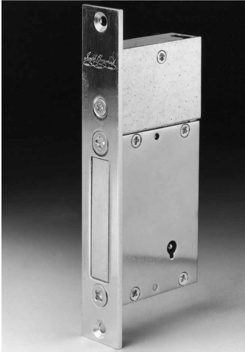
MD 27A MD 27AA MD 27FA MD 27FAA MD 17A MD 17AA