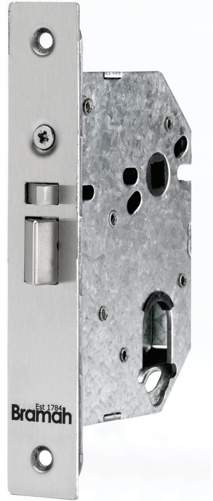
Escape Nightlatch without Snib