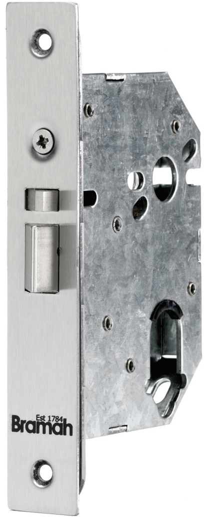
Nightlatch without Snib